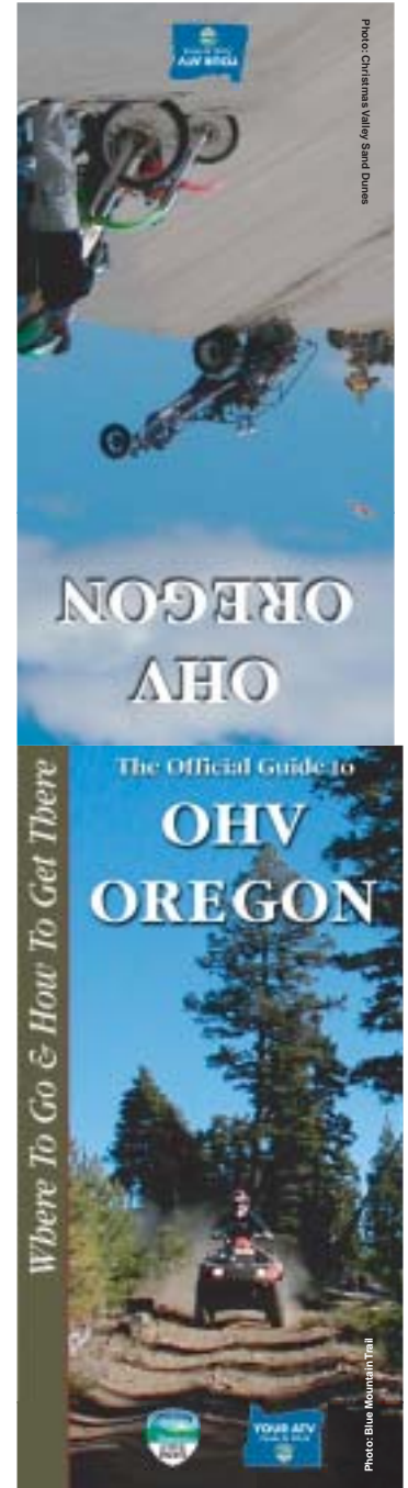
Photo: Christmas Valley Sand Dunes

Permit fee: $10 (some vendors charge an extra .50)